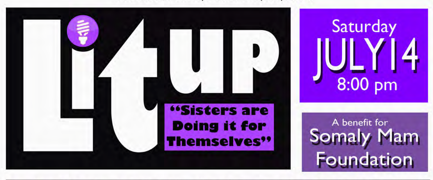
St. Michael's Community Outreach Projects presents