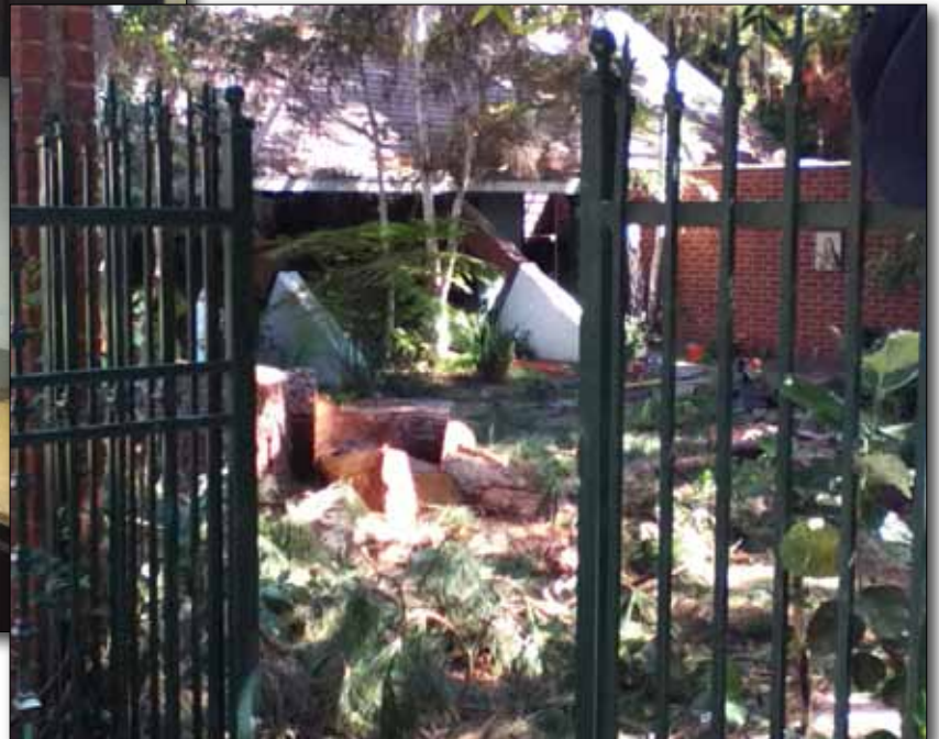
Six Canary Island pines being removed from the meditation garden.