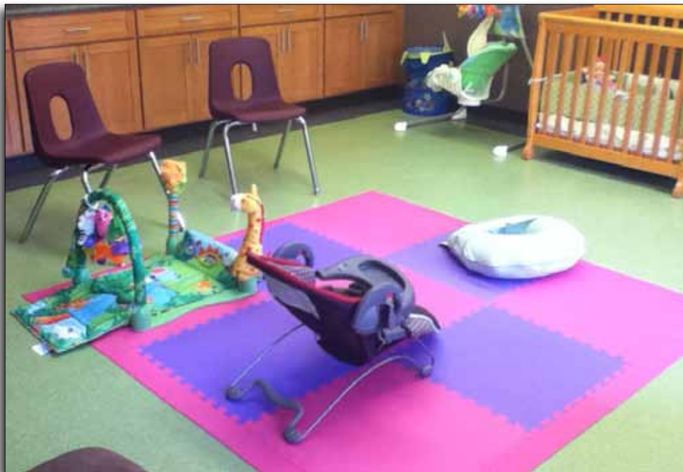
The new nearly-completed nursery.