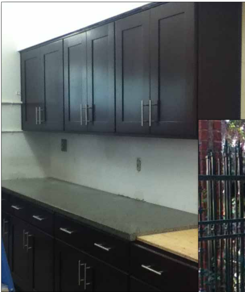
New cabinets and countertops in the kitchen