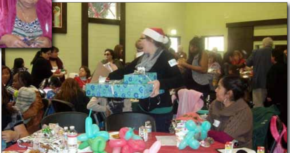
Scenes from Holiday Cheer 2012.